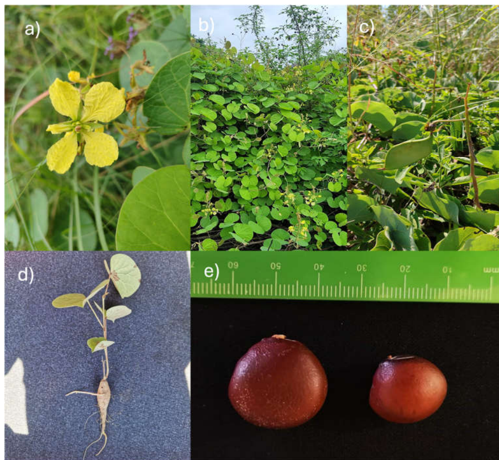
Figure 1. Flower (a), leaves (b), pods (c), tuber (d), and seeds (e) of Tylosema fassoglense . Note: In panel (e) Tylosema fassoglense seeds are in the left-hand side and Tylosema esculentum seeds on the right-hand side.

Tylosema fassoglense is a savanna plant with an extensive range in southern Africa and eastern Africa [23]. The botanical system of the species is as follows: genus— Tylosema , family—Fabaceae, order—Fabales, subclass—Magnoliidae, class—Equisetopsida, phylum—Streptophyta [15]. It has notable intraspecific morphological variation [14], as well as longer vines, longer functional tendrils, rusty pubescence on young growths and on the veins of leaves, longer petioles, shallowly bilobed leaves, and larger, flatter fruit pods that are distinctly woody compared to the better studied Tylosema esculentum [14]. Tylosema fassoglense is also characterized by a large underground tuber that has high water storage and retention capacity [14]. Figure 1 shows different parts of Tylosema fassoglense .